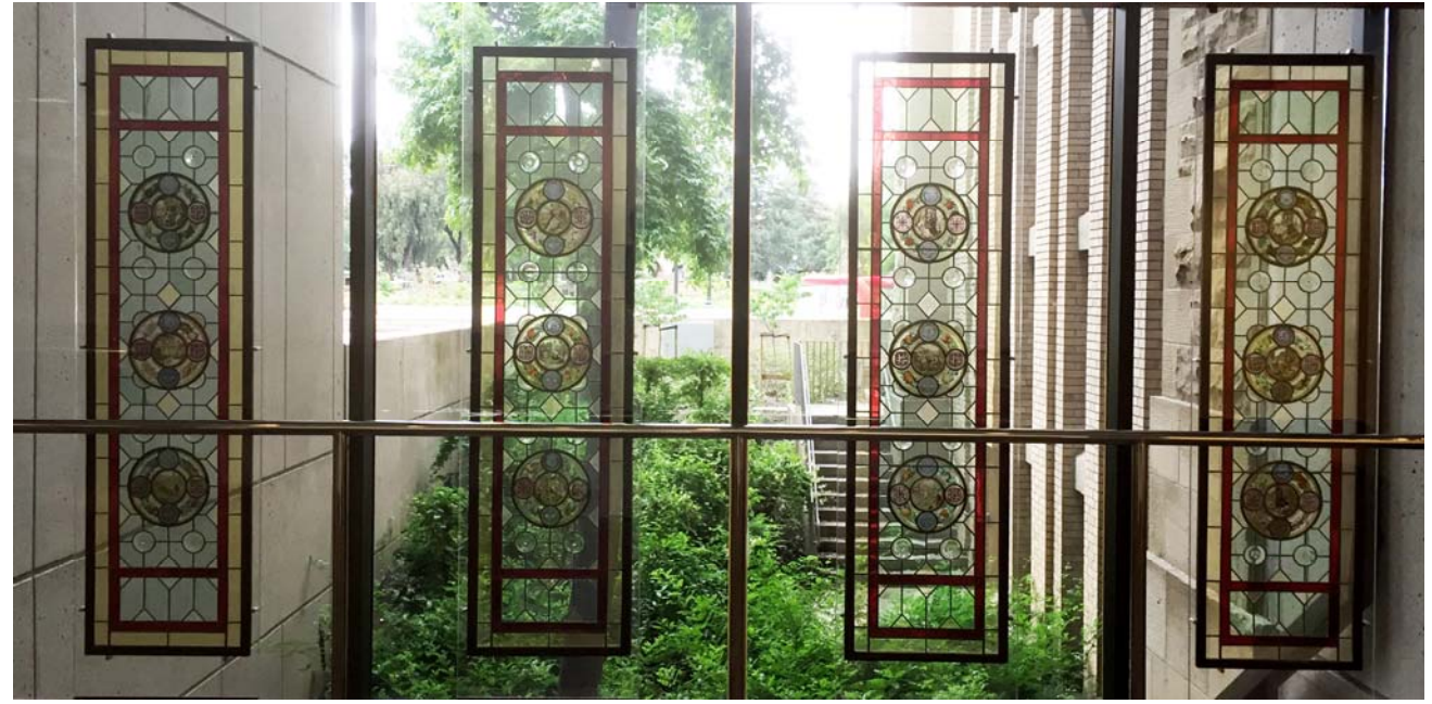
Near the Green East entrance are stained glass window panels displaying the months of the year.