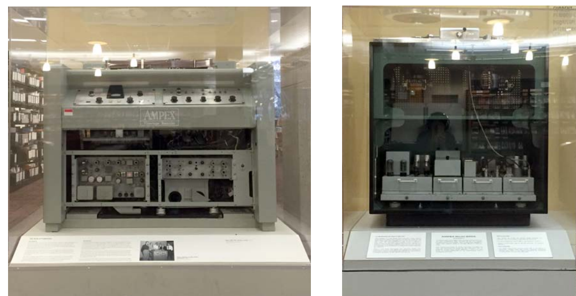
Ampex Recorders Display

The large grey device is an early two-inch VRX-1000 videotape recorder, the fourth ever produced. It was manufactured by AMPEX and purchased by CBS for use in their Television Broadcast Network in 1956. The black device is an Ampex Model 200A professional tape recorder which went into broadcast service at the ABC radio network facility in Chicago, IL in 1948 to shift radio programs from the East Coast to the West Coast. It was once owned by Bing Crosby. These artifacts are part of the Special Collections Historical Collection of Ampex Corporation, 1944-1999. Ampex was one of Silicon Valley's pioneering technology companies and, for over five decades, an industrial leader in magnetic recording and data storage. The collection, 577 linear feet in size, includes the artifacts of the former Ampex Museum of Magnetic Recording; an extensive photographic archive of more than two hundred thousand images; documentation and product files; and Ampex publications.